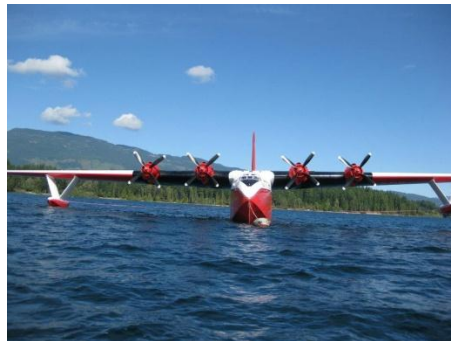
Port Alberni is home to the world's largest water bombers.