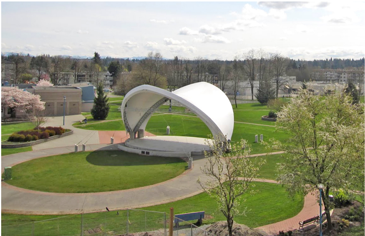
Douglas Park, located in Langley City.

http://www2.gov.bc.ca/gov/theme.page?id=4DE87E7EE0859251309F8142B9BD4824